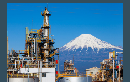
Oil & Gas