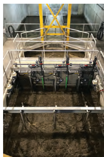
Figures 2 & 3: Operation of NHP210-300S at Arbutus Ridge