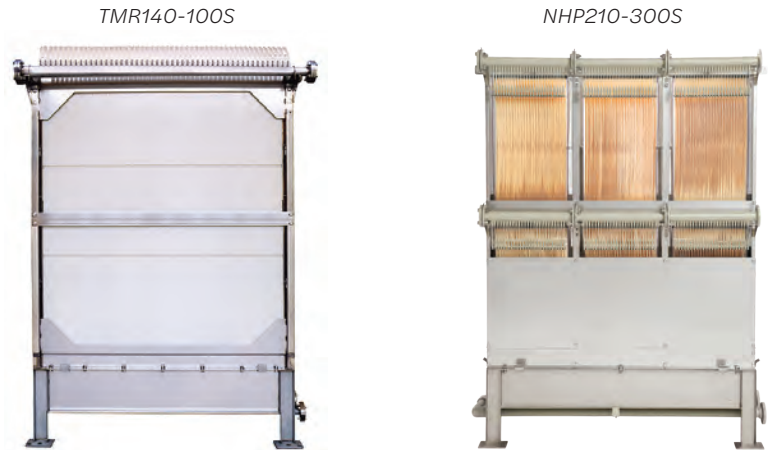
Figure 5: Toray flat-plate and flat-sheet MBR Modules