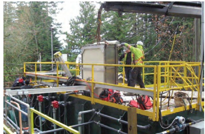
Figure 1: Installation of TMR140-100S at Lambourn Estates

MBR systems are proven to produce a high-quality effluent with a compact footprint, low maintenance, and modular design that makes it easy to upgrade. Table 1 below shows the typical MBR effluent quality when treating municipal sewage. An analysis performed in June 2020 at the UV outlet of Sentinel Ridge shows the MBR modules are still producing excellent treated water quality (Table 2).