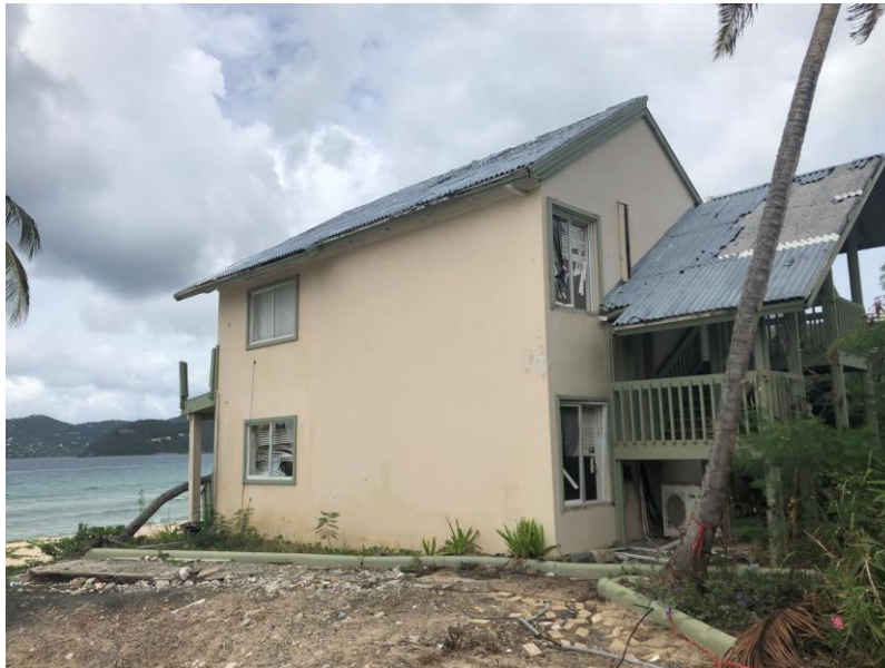
The devastation of Hurricane Irma took many of the resort's facilities offline, including the wastewater plant.

Fortunately, the following year, a group of international investors acquired the property with a vision to rebuild the hotel and resort to its former glory and updated to a new standard of excellence – beach-front villas, hospitality areas, recreation areas and a complete rebuild of the infrastructure. Over a period of several months in 2018, Enereau worked with the client to develop and refine a range of concepts for a wastewater treatment plant that would fit into the footprint of the previous facility, support the property redevelopment goals and produce a continuous and reliable supply of up to 25,000 USgpd (100 m 3 /d) of reuse-quality water for landscape applications.