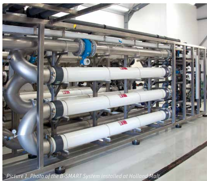
Picture 1. Photo of the B-SMART System installed at Holland Malt

As the world's population increases, so does the level of beer consumption. Studies suggest that by 2025, global beer consumption will grow by 15%. In order to meet the increasing demand, Holland Malt has decided to double its malting capacity in its Eemshaven plant. Unfortunately, doubling the production capacity means doubling the water consumption . Thus, Holland Malt needed a reliable and stable system that could provide high-quality permeate which can be reused for the production of malt while providing significant cost savings . After testing a few pilot systems from various manufacturers, Holland Malt chose the B°SMART® MBR filtration system from Berghof Membranes for its reliability, high quality permeate production, ease of use and low maintenance.