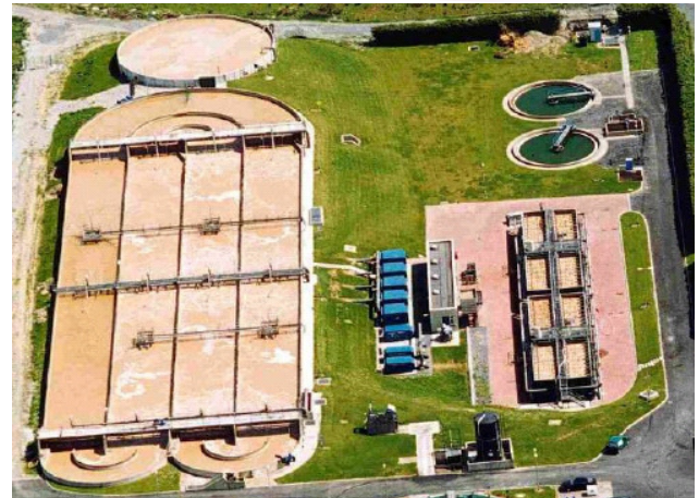
View of the plant (above). Plant diagram (below).